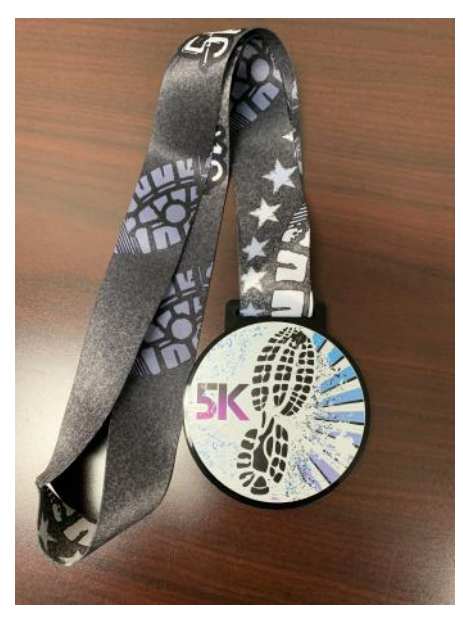
Camporee 2020 5K medals.