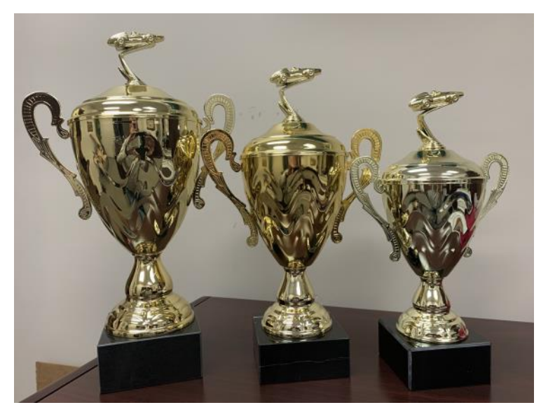
Speed category trophies—first, second, and third.

Get ready for the Soap Box Derby!!! Cars can be entered either in the speed category or the design category (design category cars are not raced for speed—they are judged for design). First, second, and third places for each category will receive a trophy!