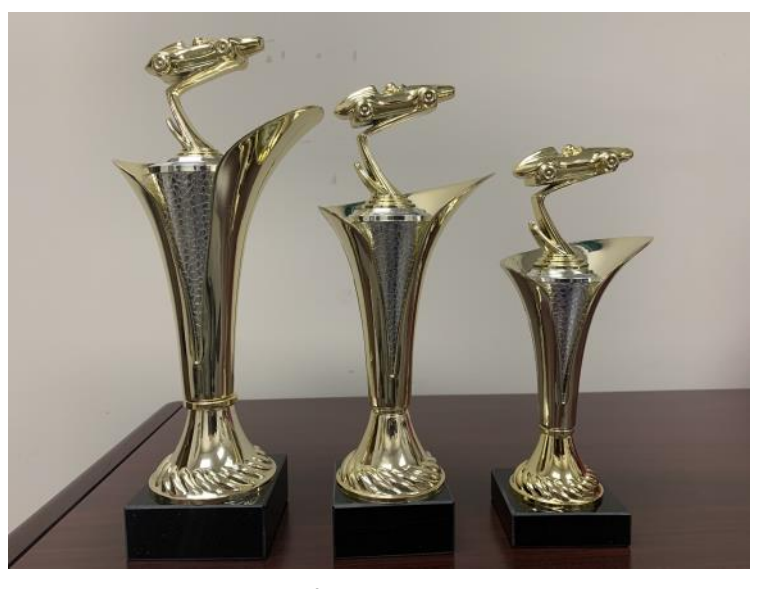
Design category trophies—first, second, and third.