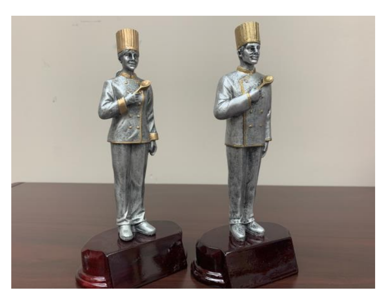
Cooking Challenge trophies.

Logo of the competition will be embroidered on the apron prize.