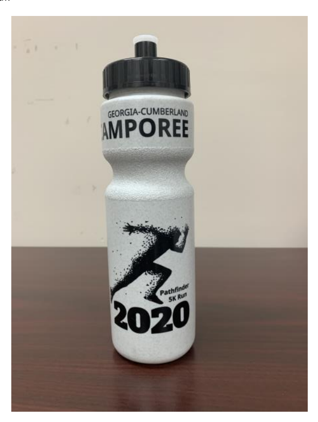
Camporee 2020 5K water bottle.

Ready, set, GO! Staff and Pathfinders will have the opportunity to sign up for the camporee Sunday morning 5K race (sign ups will happen at camporee). Each participant will receive a commemorative water bottle, and winners from each category will win a medal.